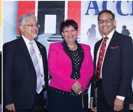
MINISTERIAL SUPPORT: Senator Dr. the Honourable Bhoendradatt Tewarie (left) Senator the Honourable Christine Newallo-Hosein (centre) and Senator the Honourable Vasant Bharath (right.)