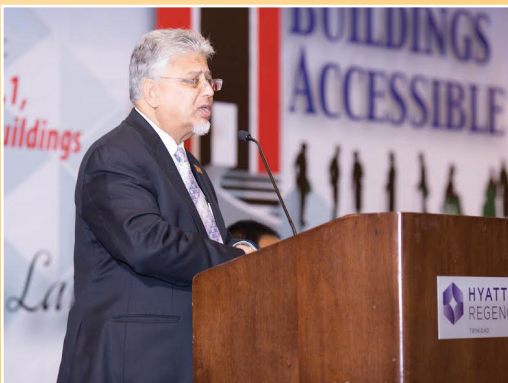
COMMITTED TO THE CAUSE: Senator Dr. the Honourable Bhoendradatt Tewarie, Planning and Sustainable Development Minister pledging his Ministry's support towards the initiative.

Senator the Honourable Vasant Bharath Minister of Trade, Industry, Investment and Communications and Minister in the Ministry of Finance and the Economy in delivering the feature address at the launch to some 100 plus stakeholders which included persons from the Architectural associations, Building contractors and Government Ministries and Agencies at the Hyatt Regency Hotel on Friday 24th July, 2015, stated that “building codes and standards can play a key role in ensuring that system infrastructure including our buildings are fit for purpose, sustainable, safe and accessible for all. Properly designed safe and accessible buildings are essential to expanding production