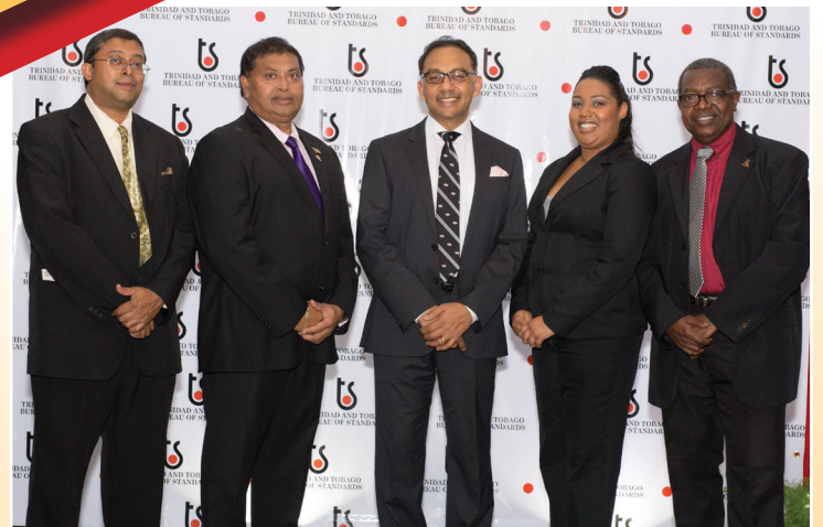
IN THE CENTRE: Senator the Honourable Vasant Bharath Minister of Trade, Industry, Investment and Communications and Minister in the Ministry of Finance and the Economy (centre) is all smiles with representatives of the TTBS' Board and Management Team.